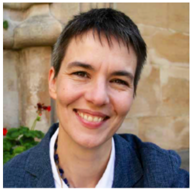
The Senior Dean

He supports the well-being of all Oriel members. He is particularly responsible for the spiritual life of the community. He is always happy to listen and talk about any matter in complete confidence.